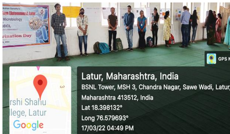
Posters exhibited by participants on the occasion of National Vaccination Day